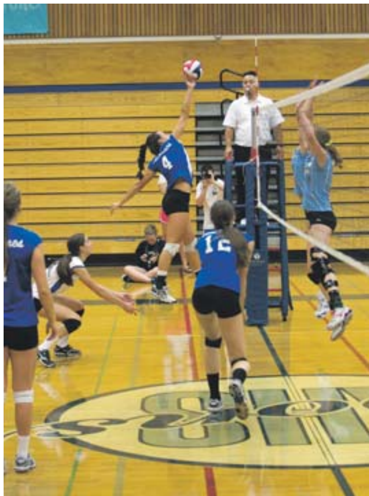
Acalanes team last week