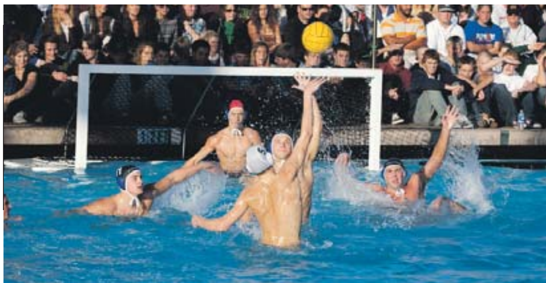
Acalanes and Miramonte in a game last fall

This fall is set to be another great year in the pool as Miramonte, Acalanes, and Campolindo all look to take this year's DFAL crown.