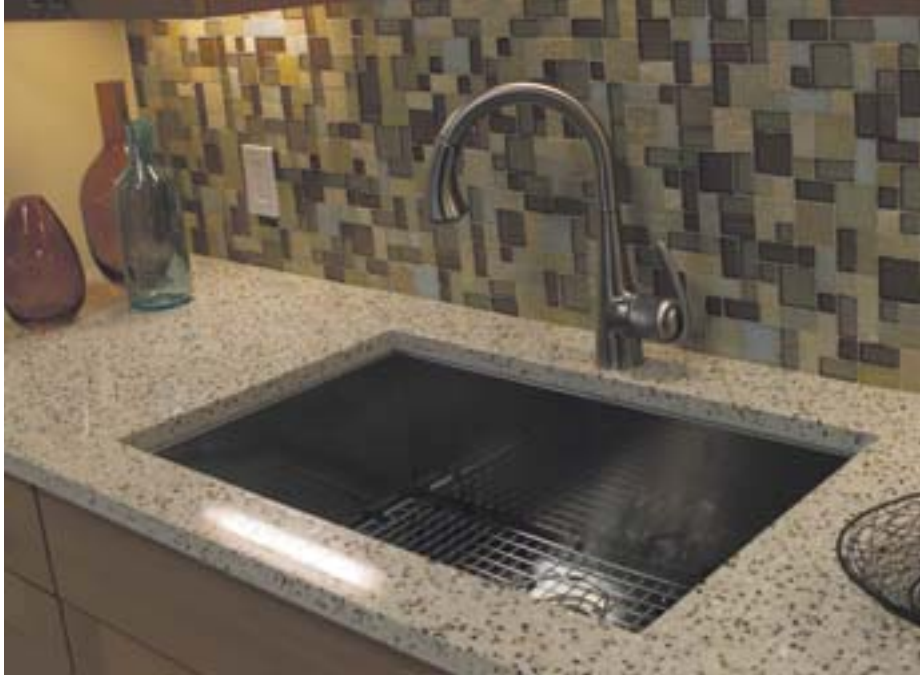
Faucet by Grohe. Low-flow faucet. Available in several styles

What will the sustainable home of the future look like? Visitors to this weekend's Lafayette Art and Wine Festival will have a chance to gaze into the crystal ball by stopping by Sustainable Lafayette's TomorrowLand.