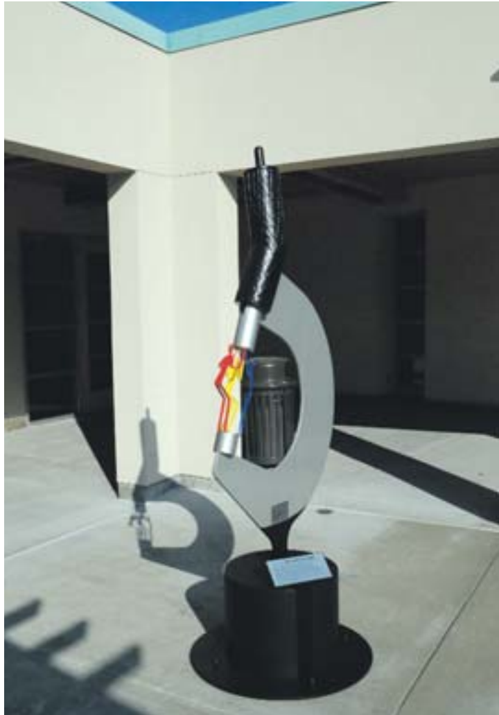
The Measure of Man