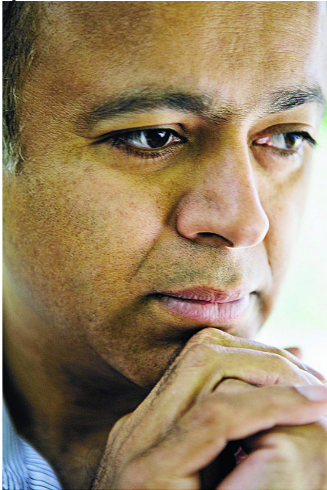
Abraham Verghese

When I called Abraham Verghese for our phone interview to preview his upcoming appearance at Lamorinda's Three Communities, One Book Program on October 26th, I was expecting to wait.