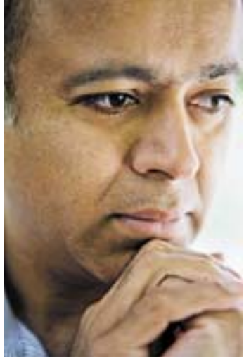
Abraham Verghese

When I called Abraham Verghese for our phone interview to preview his upcoming appearance at Lamorinda's Three Communities, One Book Program on October 26th, I was expecting to wait.