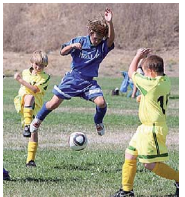
Lafayette's LYMA 5/6th grade boys team, Italy, beat Brazil 4-1 on Saturday, September 25.