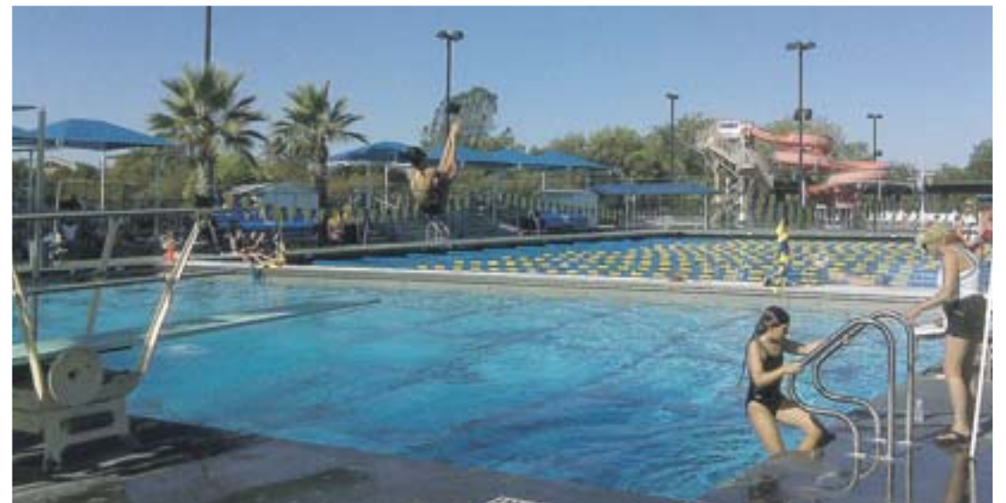
Brenna Certone doing a forward one and a half somersault in the pike position from the 1M board. Photo provided Sherman Dive School competed in the Dos Rios Invitational Diving Meet on September 25 in Folsom.