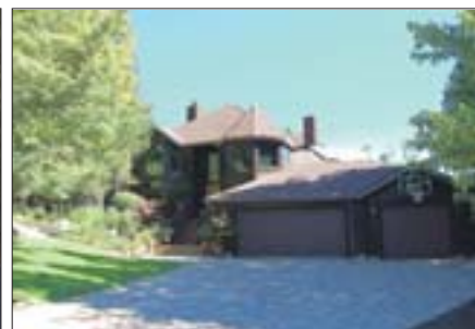
Lafayette $1,425,000 4/3.5