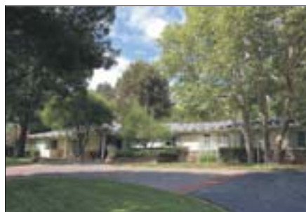
Lafayette $1,495,000 5/4