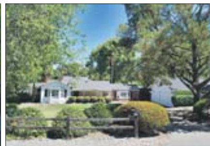
Lafayette $1,350,000 4/3

5 Moraga Way | Orinda | 925.253.4600 • 2 Theatre Square, Suite 211 | Orinda | 925.253.6300