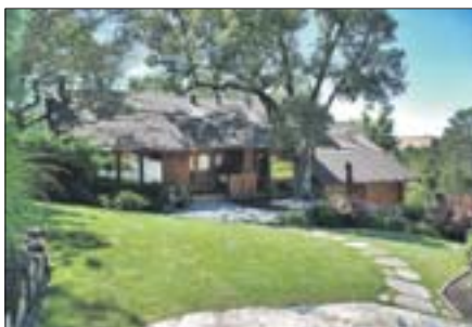
Lafayette $1,595,000 4/4