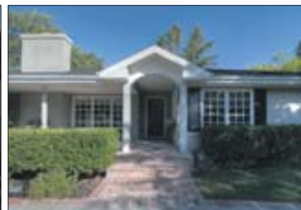
Orinda $1,625,000 4/3.5