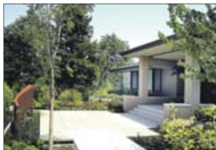
Lafayette $8,500,000 7/9

Coldwell Banker takes your home global with its award winning websites