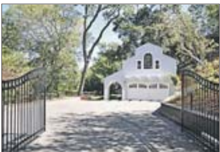
Orinda $1,575,000 5/4