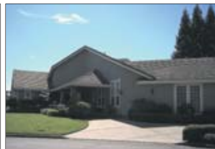
Lafayette $1,638,000 4/3.5