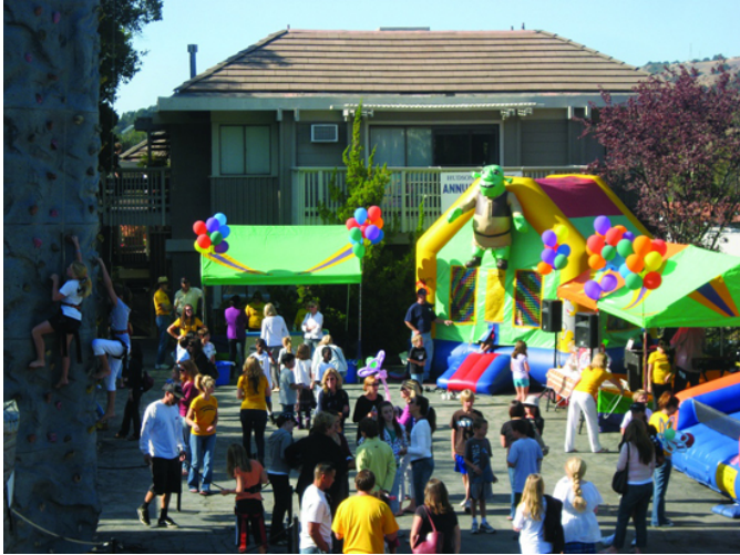
Hudson & Axelrode Orthodontics hold their annual client event fair in Moraga

October 21, City Time Capsule Ceremony & Community/Council Reception at City Hall, from 3:00 to 6:00 p.m. This community event is part commemoration of the City of Orinda 25th Anniversary.