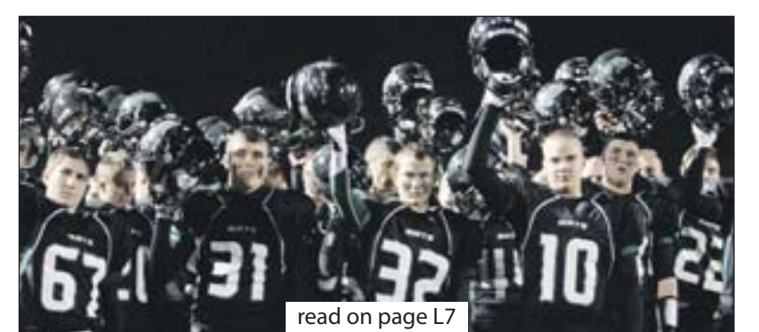
read on page L7

Mailed and delivered to 24,200 homes and businesses in Lamorinda. return to: Lamorinda Weekly • P.O. Box 6133 • Moraga, CA 94570 PRRST STD U.S. POSTAGE PAID AD-VANTAGE