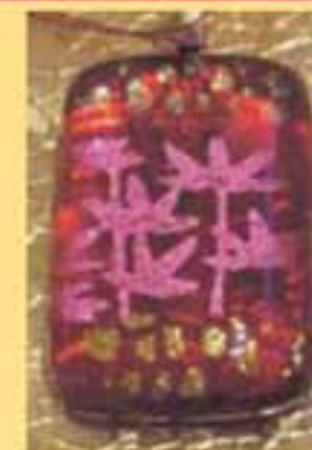
Glass pendant by Judith Feins

9th Annual Overhill Road Holiday Boutique, December 3, 12-8 p.m., Dec 4 & 5, 11am-6pm. Located, 214 Overhill Road, Orinda. Percentage of proceeds to benefit the Komen Breast Cancer Foundation. Hand-crafted gifts and foods by over 30 local crafters. Free admission. For more information please call (925)-253-9065 or (925)-254-3944.