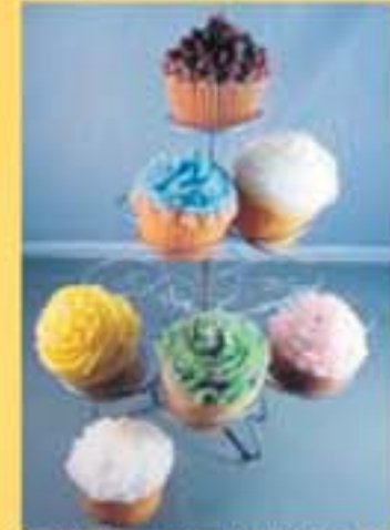
Candle Cupcakes II by Jude Coren

Winter Wonderland is now open. The public is invited to celebrate the season with a festive reception on Friday, December 3rd from 6:30 to 8:30pm. Browse our exclusive selection of wonderful gift items including shimmering hand-made jewelry, locally inspired ornaments, elegantly tooled ceramics and gallery walls brimming with paintings, pastels, monotypes, photographs and more. Lafayette Gallery is a 23-member cooperative at 50 Lafayette Circle in downtown Lafayette. Gallery Hours are Tuesday to Saturday, 11am-5pm.