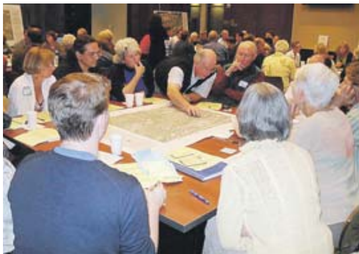
A group of residents point out their suggestions for future development on large maps of the Golden Gate Way and Plaza Park area.

A standing-room-only crowd of residents came together to chime in with their visions for the look and feel of the Golden Gate Way neighborhood twenty years in the future.