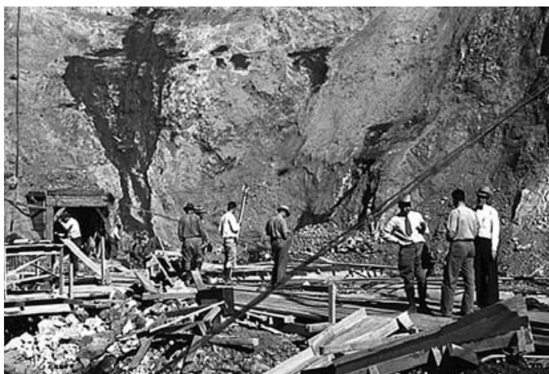
Construction of bores 1 and 2 of the Caldecott Tunnel in the 1930's.

Tunnel building technology has changed significantly since a group of merchants from Oakland pooled their resources to fund the first hand-dug passageway through the hills over 100 years ago. What hasn't changed is how long it takes to tunnel through the dirt and bedrock between Orinda on the east side and Oakland on the west.