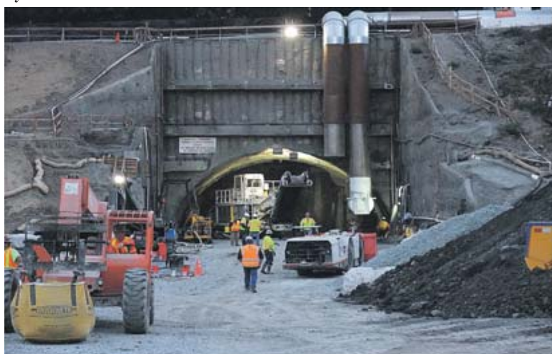
Construction on the east side of the 4th bore of the Caldecott Tunnel, October 2010.