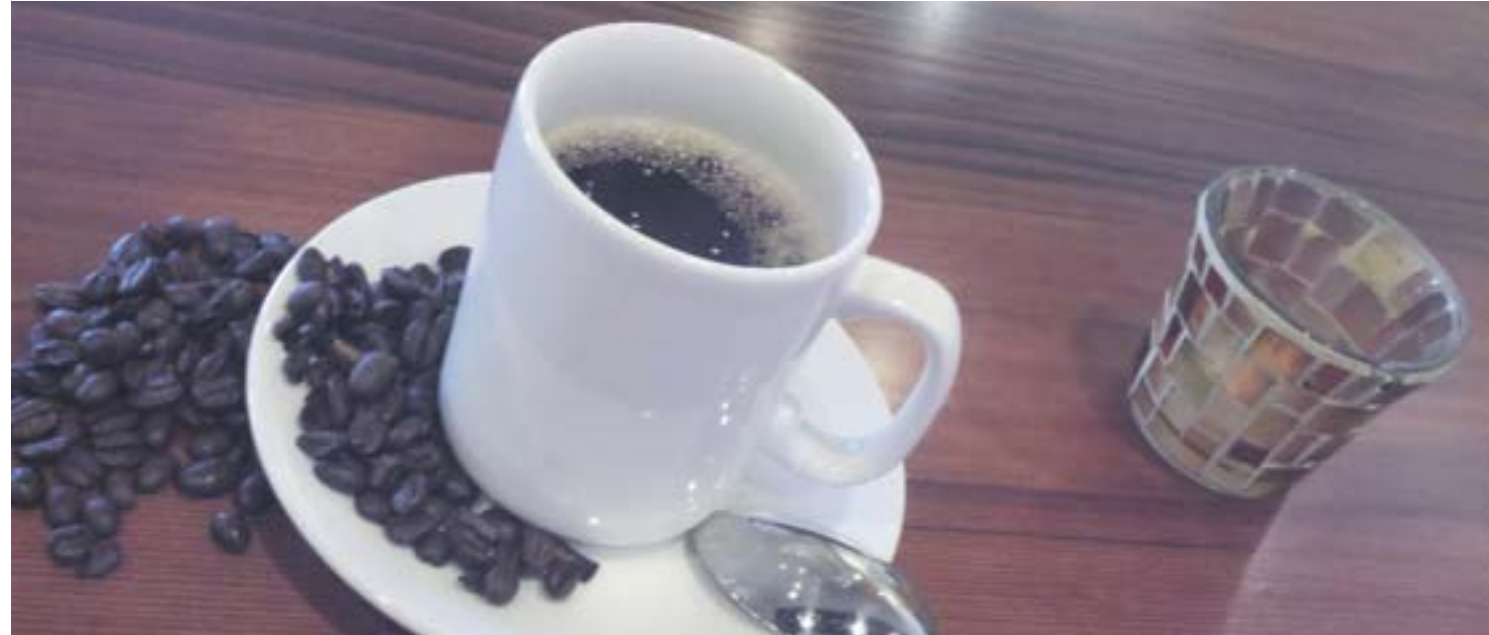
Table 24 is now open at Theatre Square in Orinda

Breakfast, Lunch, and Dinner Open every day at 8 AM!!!