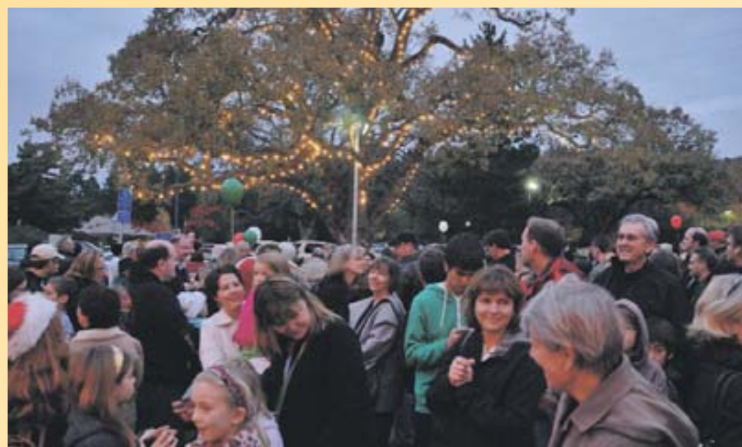
Orinda's Hospice tree was lit last weekend to the enjoyment of a large, dry crowd; while late rain did not deter people from the Hospice tree-lighting in Lafayette!