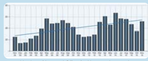
Number of Accepted Offers for Homes in Lamorinda

Overall market trend for number of monthly sales continues to improve.