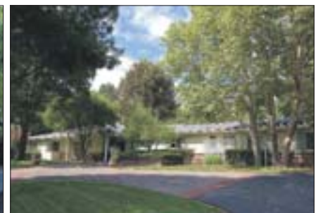
Lafayette $1,395,000 5/4