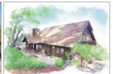
Orinda $775,000 2/2.5

5 Moraga Way | Orinda | 925.253.4600 • 2 Theatre Square, Suite 211 | Orinda | 925.253.6300