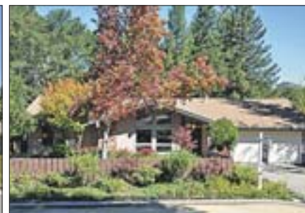
Orinda $1,025,000 5/2