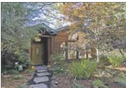
Orinda $1,350,000 4/3