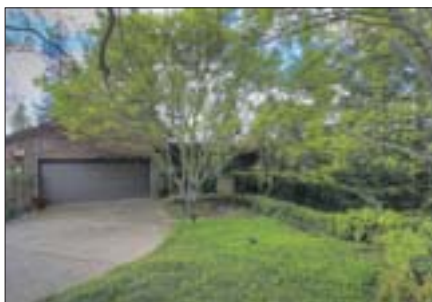
Orinda $1,095,000 3/2.5