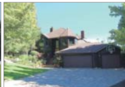
Lafayette $1,425,000 4/3.5