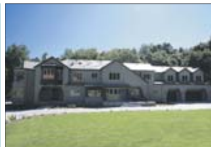
Lafayette $2,595,000 5/4.5

Coldwell Banker takes your home global with its award winning websites