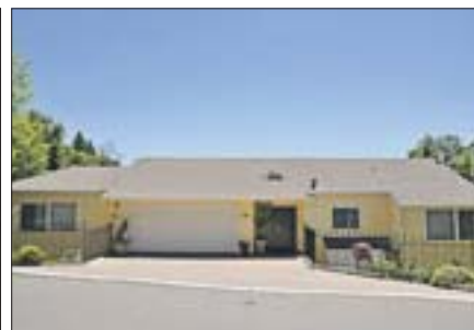
Orinda $1,050,000 3/3