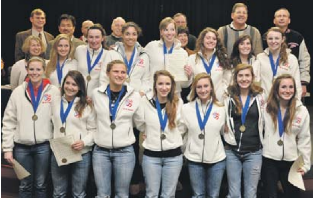
Campolindo's varsity volleyball team, with coaches and council members