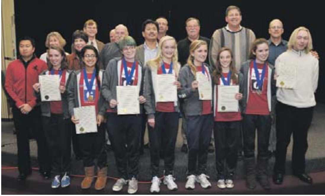
Campolindo's varsity cross country team and friends