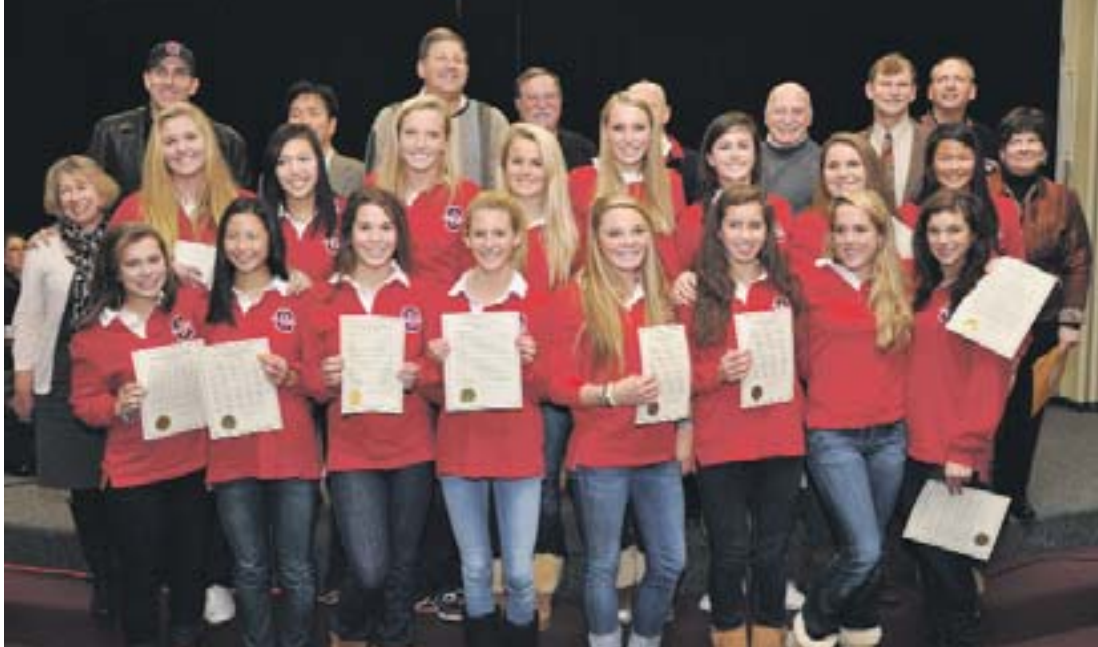
Campolindo's varsity water polo team (et al)

From the grid iron to green to summer swim team, taking pride in our young athletes is a staple of the Lamorinda community, its parents, its educators and its administrators.