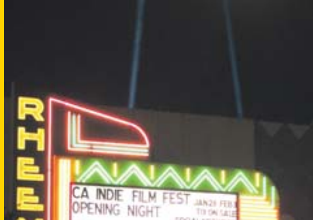
The sky lit up on opening night