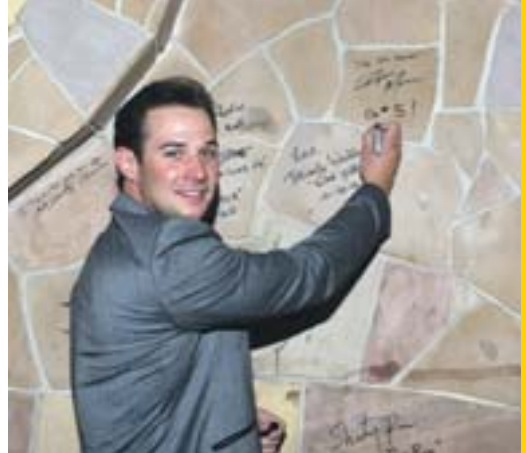
Best Actor Ryan Merriman signing the wall of fame