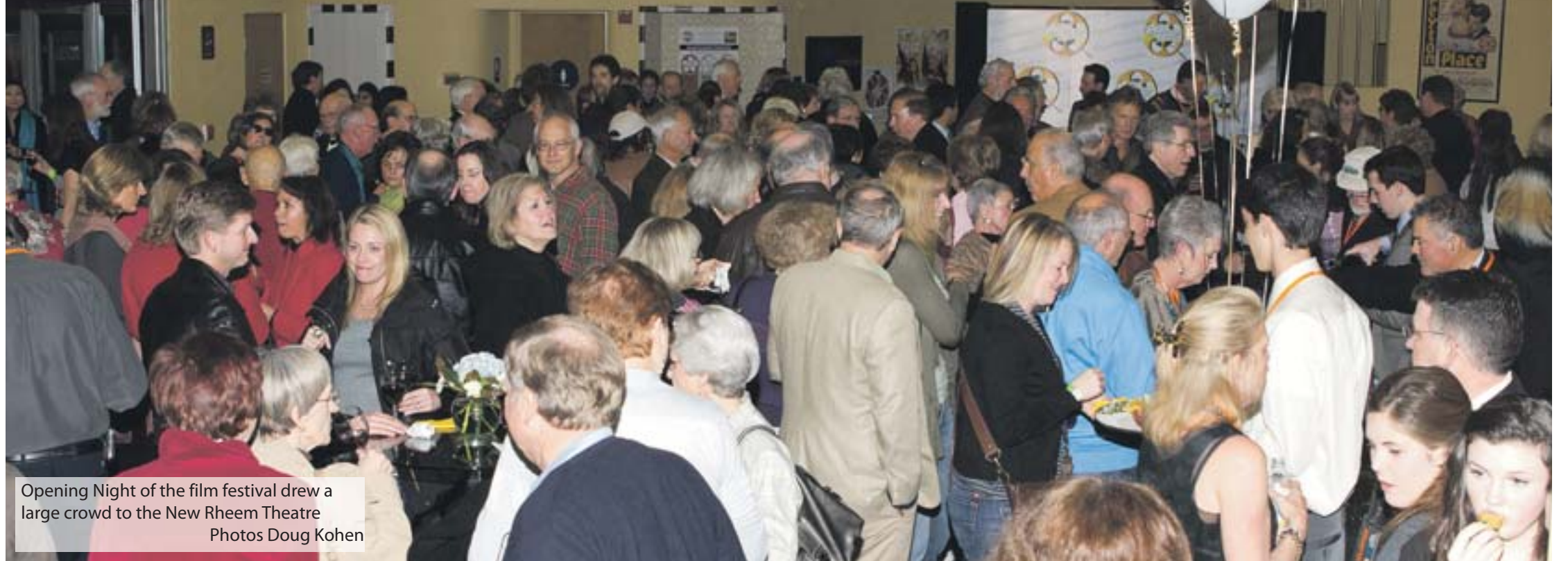
Opening Night of the film festival drew a large crowd to the New Rheem Theatre