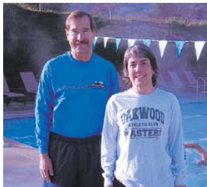
After a workout at Oakwood Athletic Club

Lafayette City Council member and former Mayor Don Tatzin (58) was the overall champion for the 2010 United States Masters Swimming (USMS) "Go The Distance" event. Tatzin finished first in the nation having swam 1,798.18 miles in 2010. He improved on