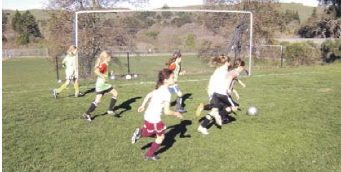
Tryouts were held at the Lafayette Community Park