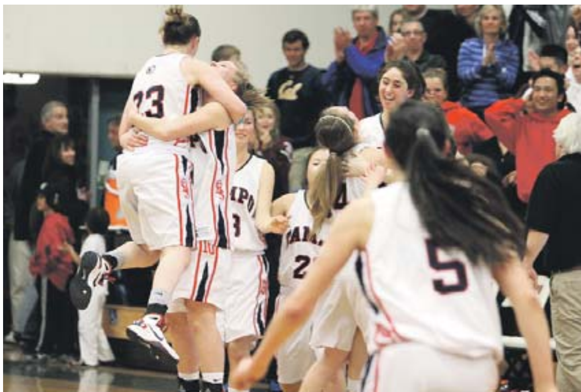
Campolindo celebrates after beating Miramonte in the second round of the NCS