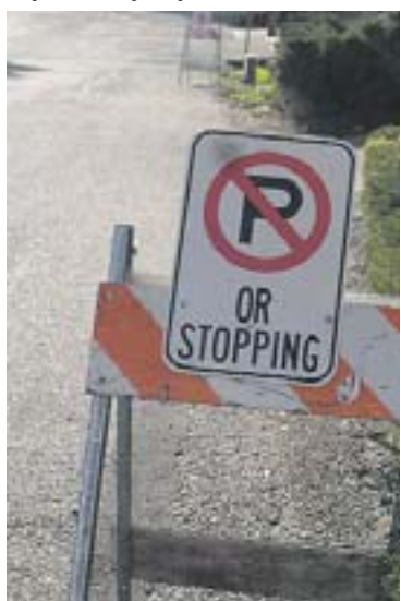
Newly installed signs on Happy Valley Court to deter unwanted taxis.