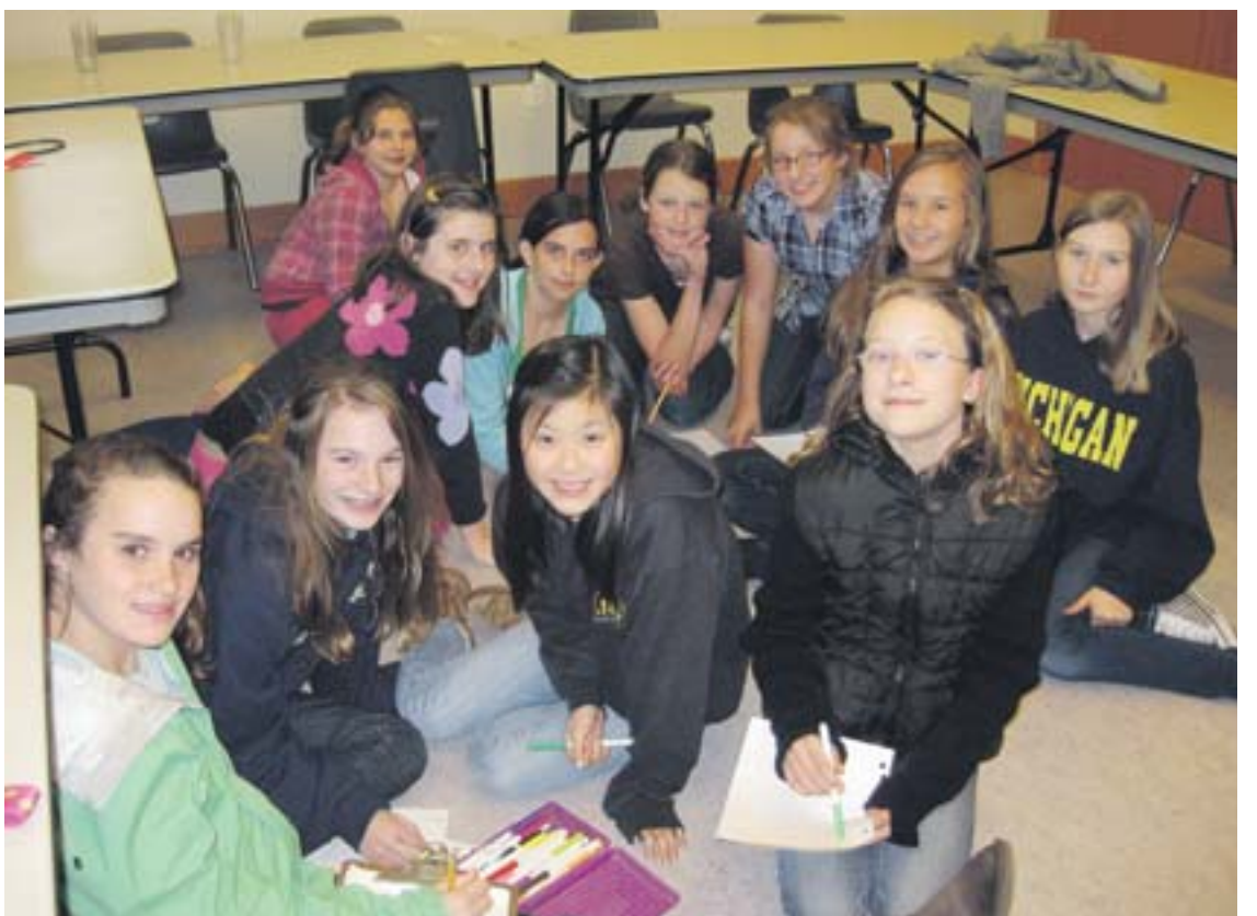
Some of the girls of Troop 30734 work on plans for their garage sale.

Submitted by Ava Tajbakhsh (member of Troop 30734)