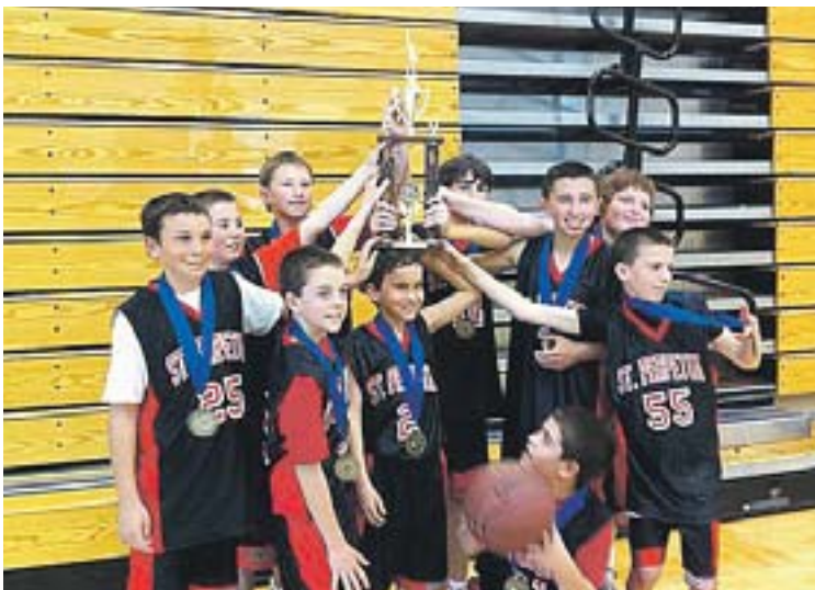
The St. Perpetua sixth grade boys CYO basketball team completed an undefeated season by winning both the West Diablo CYO Championship and the Tournament of Champions.