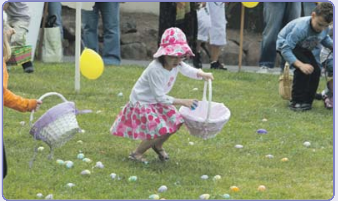
Last Saturday morning at Orinda Community Park