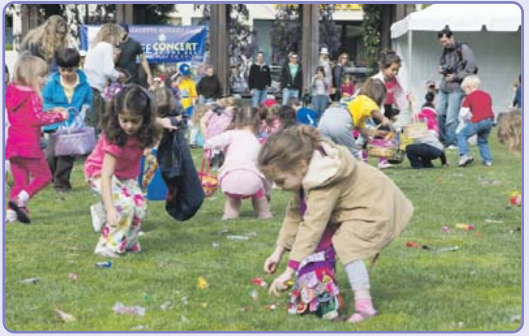
Last Saturday morning at Lafayette Plaza Park