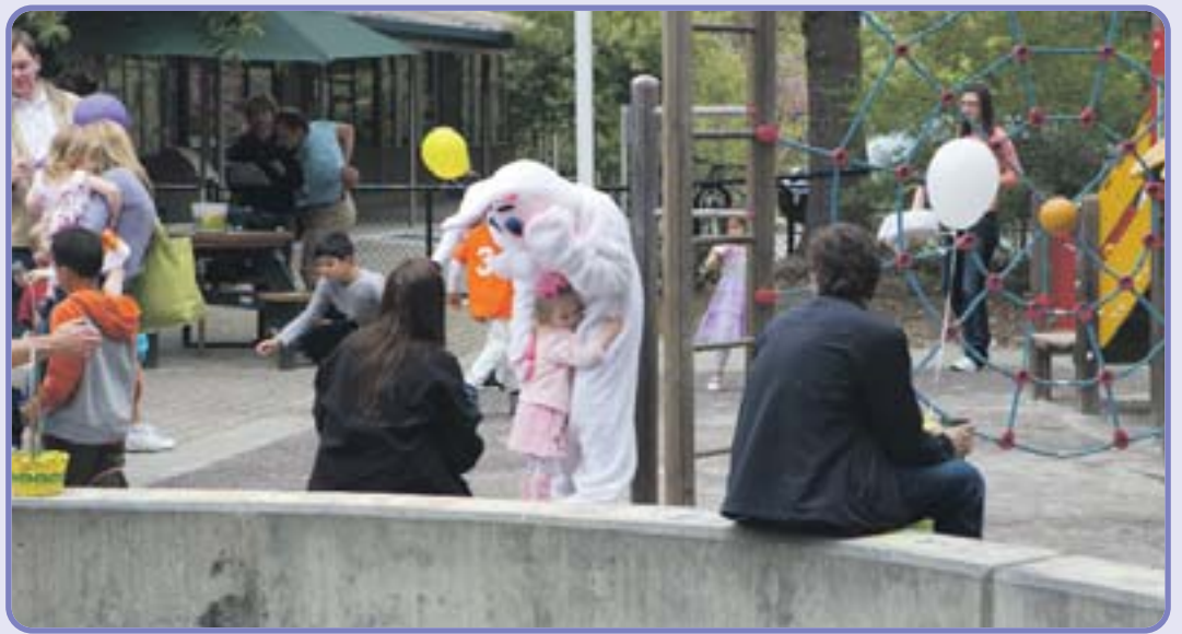
Last Saturday morning at Lafayette Community Center