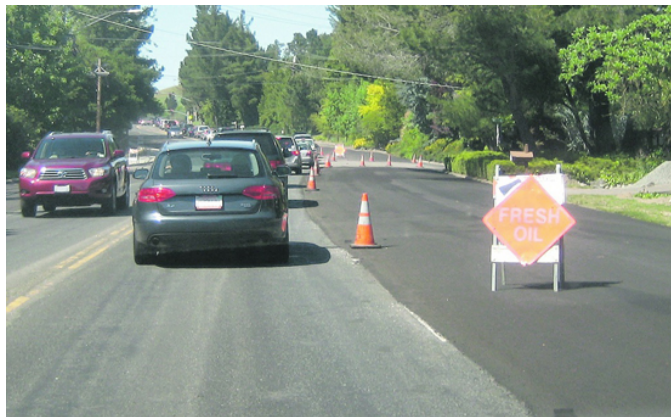
Long lines of cars as the road is repaved