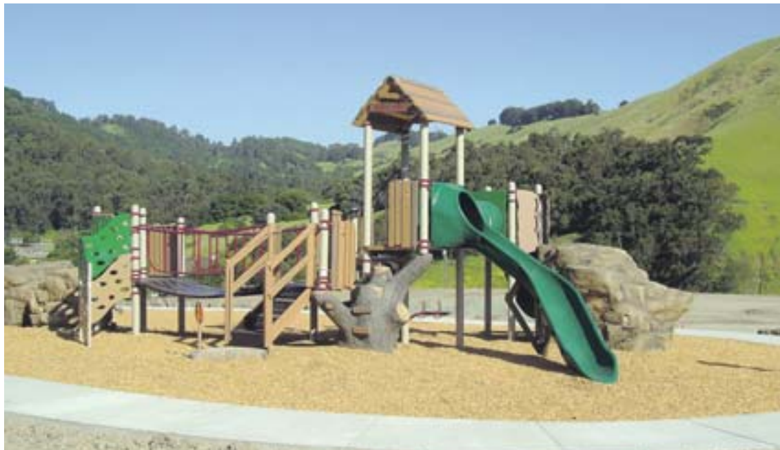
The new tot lot will not be open to the public until the playfields are ready