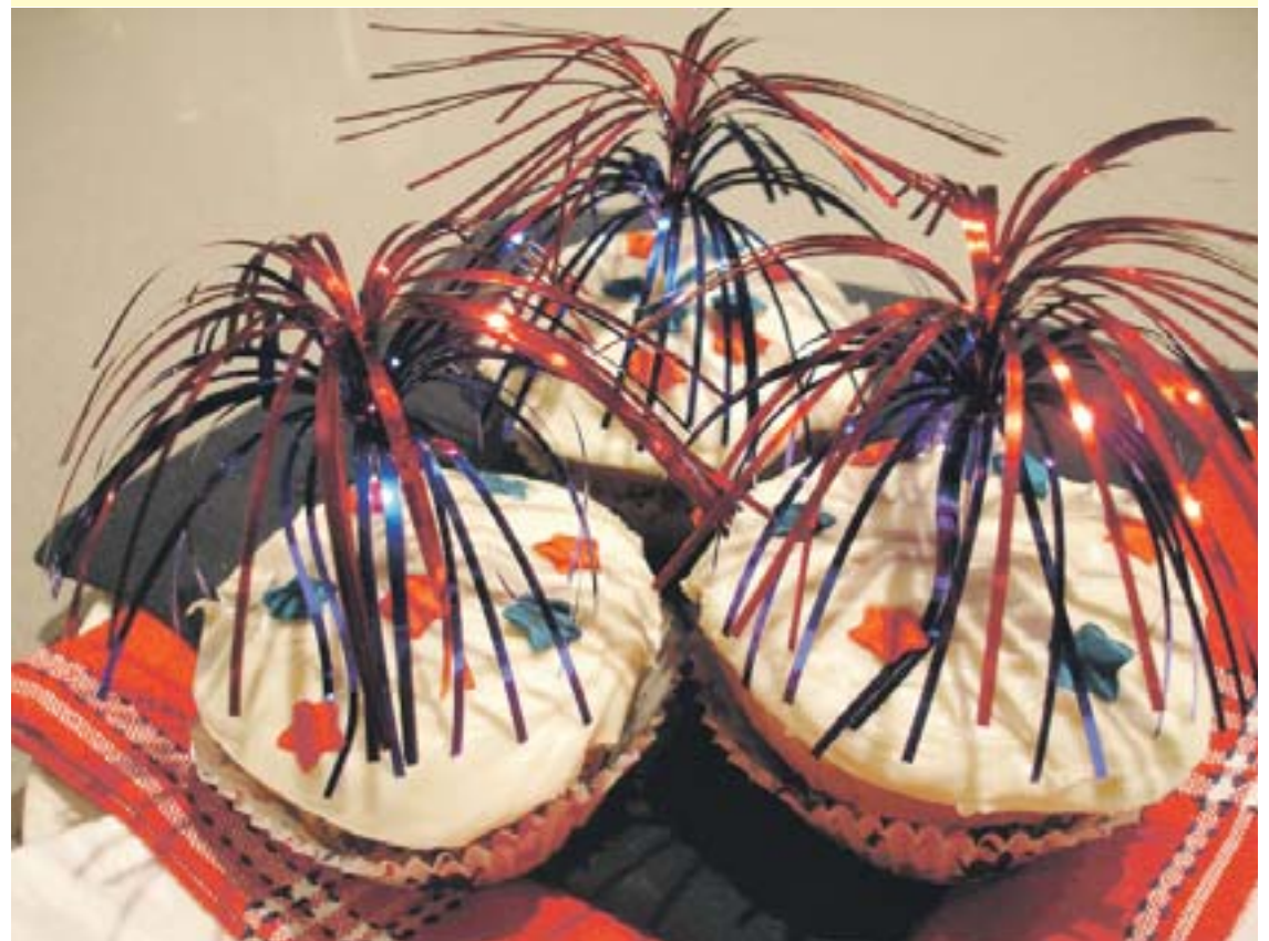
July 4th cupcakes