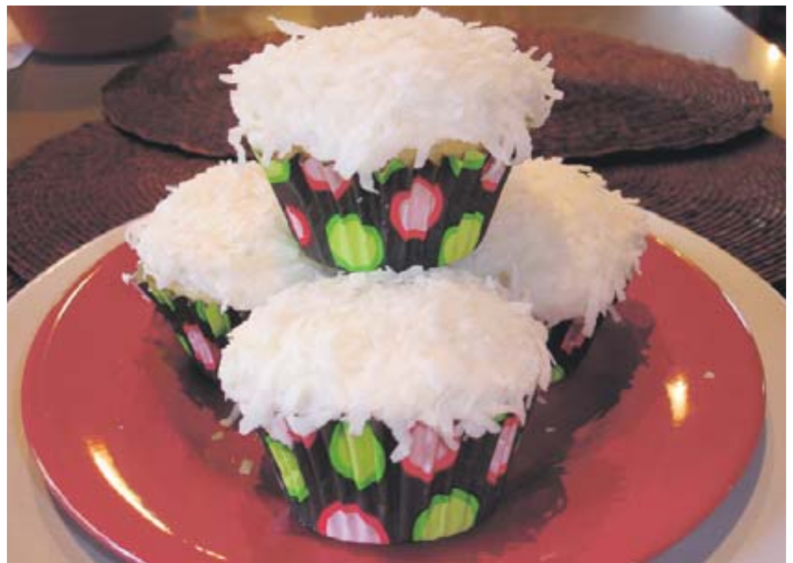
Coconut cupcakes with lime

For a trip down memory lane visit this link to watch the video: http://www.youtube.com/watch?v=Tbgv8PkO9eo