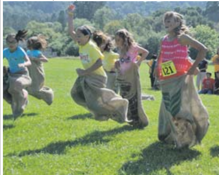
Girls' sack race