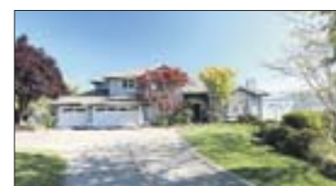
ORINDA $1,748,000 5/3. Trad. Cust. Home w/great flr plan, Chef's kit, H/W flrs, lg. Mstr Ste, 3 frpc, views! The Beaubelle Group 925-253-6300