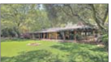
LAFAYETTE $3,378,000 5/3. Happy Valley 1930s Estate. Notable 1930's Estate has architectural charm, views & tennis court. McCann & Castello 925-253-6300