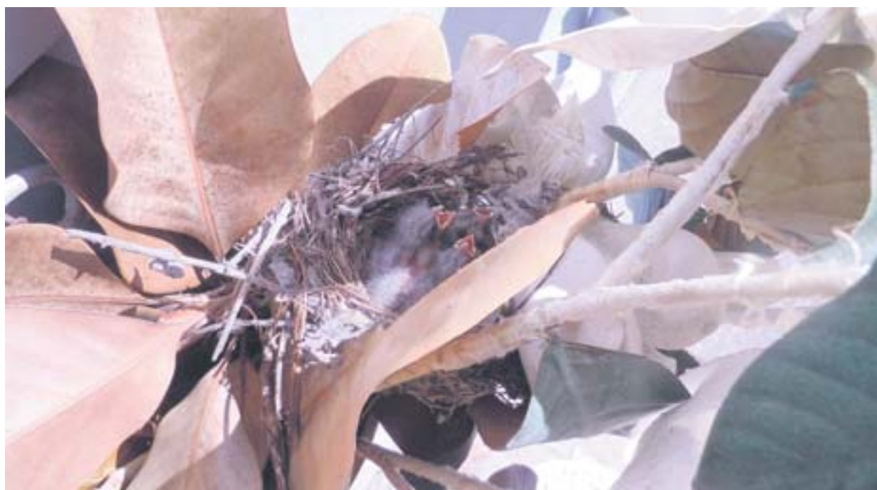
Three hungry baby robins in a nest on a back door wreath.