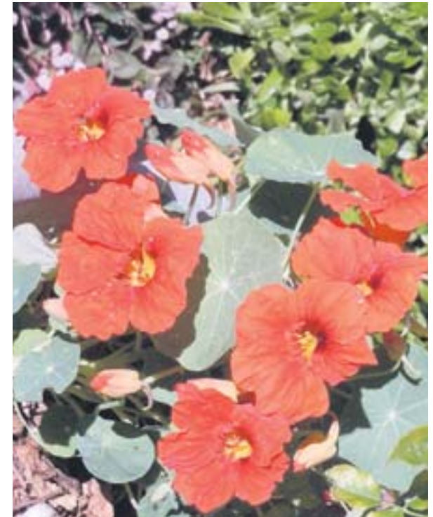
The edible nasturtium is a filler, spiller, and thriller.

the hardiest plants for our neighborhoods. My camera has been busy shooting the ordinary pleasures of living in God's country.