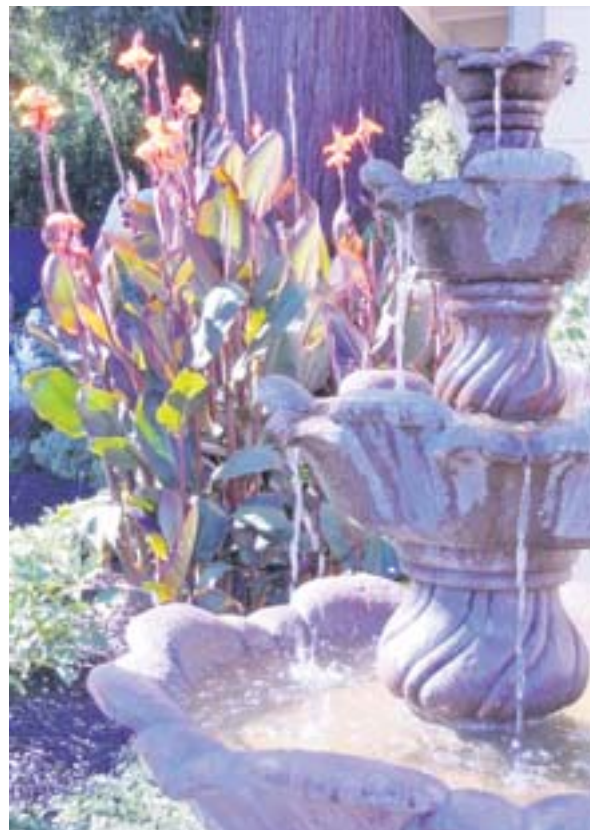
Fountains, variegated cannas, and hot weather are comfortable companions.

Other August standouts in gardens in our area are Star of Bethlehem, hydrangea, zinnias, cannas, begonias, basil, and tomatoes. Ubiquitous impatiens and petunias dress up walkways, beautify beds, and provide a riot of color. Don't discount commoners. Sometimes these are