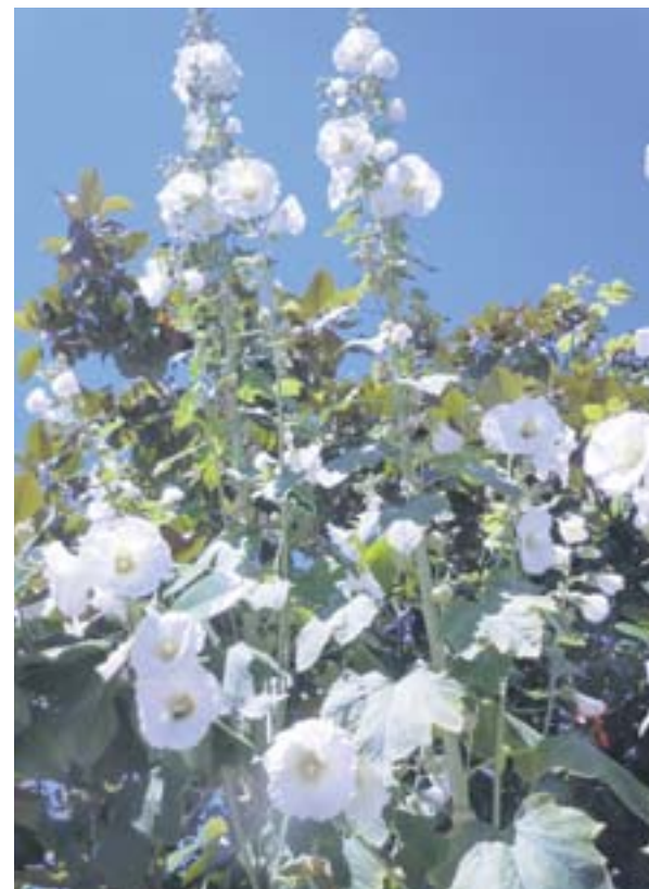
The towering 12 foot spires of hollyhock climb towards the magnolia