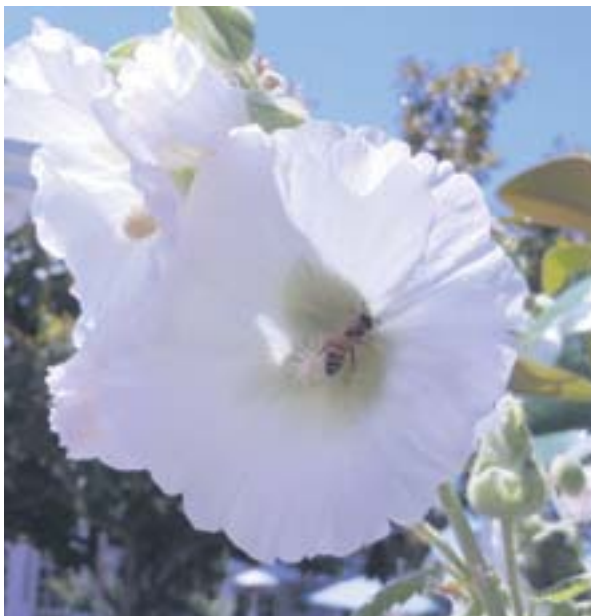
A honeybee gathers nectar from Cynthia's heirloom hollyhock.

A favorite, simple to cultivate, flower is my heirloom hollyhock. The old-fashioned stock with petals of pink, white, and fuchsia has been in my family for over one hundred years. Honeybees, bumblebees, and butterflies swarm the blooms offering endless viewfinder opportunities. When the flowers are spent, I gather the seed, dry, and scatter in the spring in anticipation of the