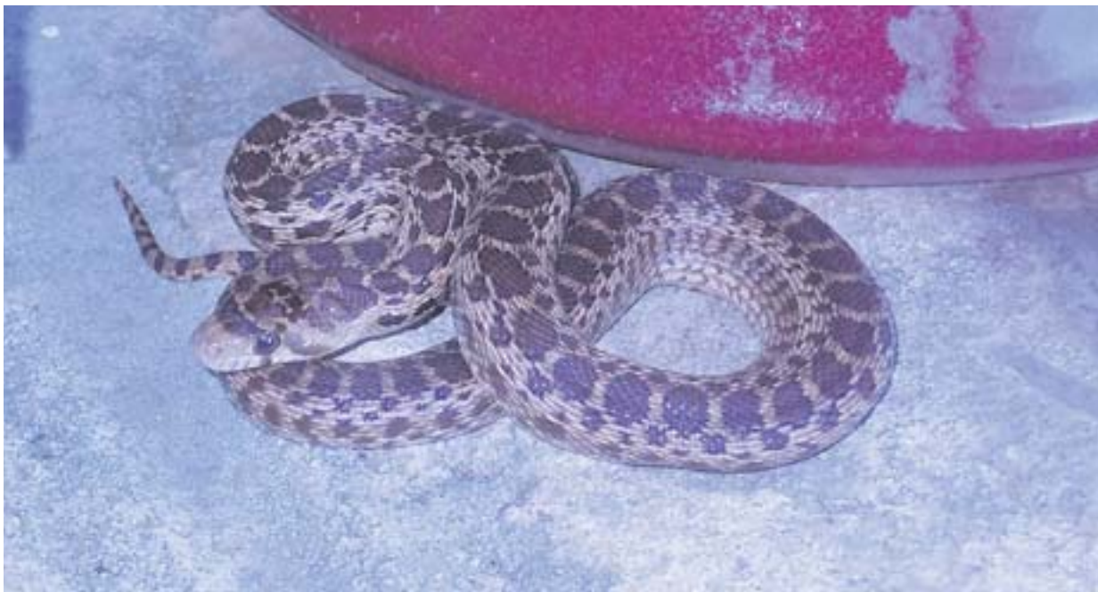
A slithering visitor: