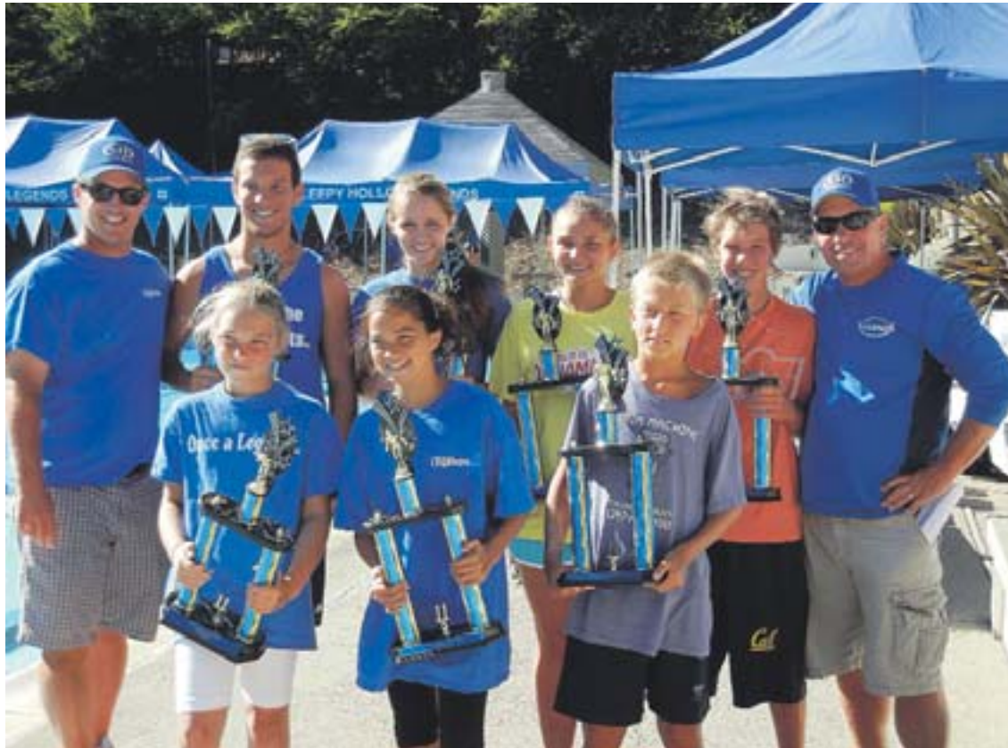
B Meet 9-and-up high point winners