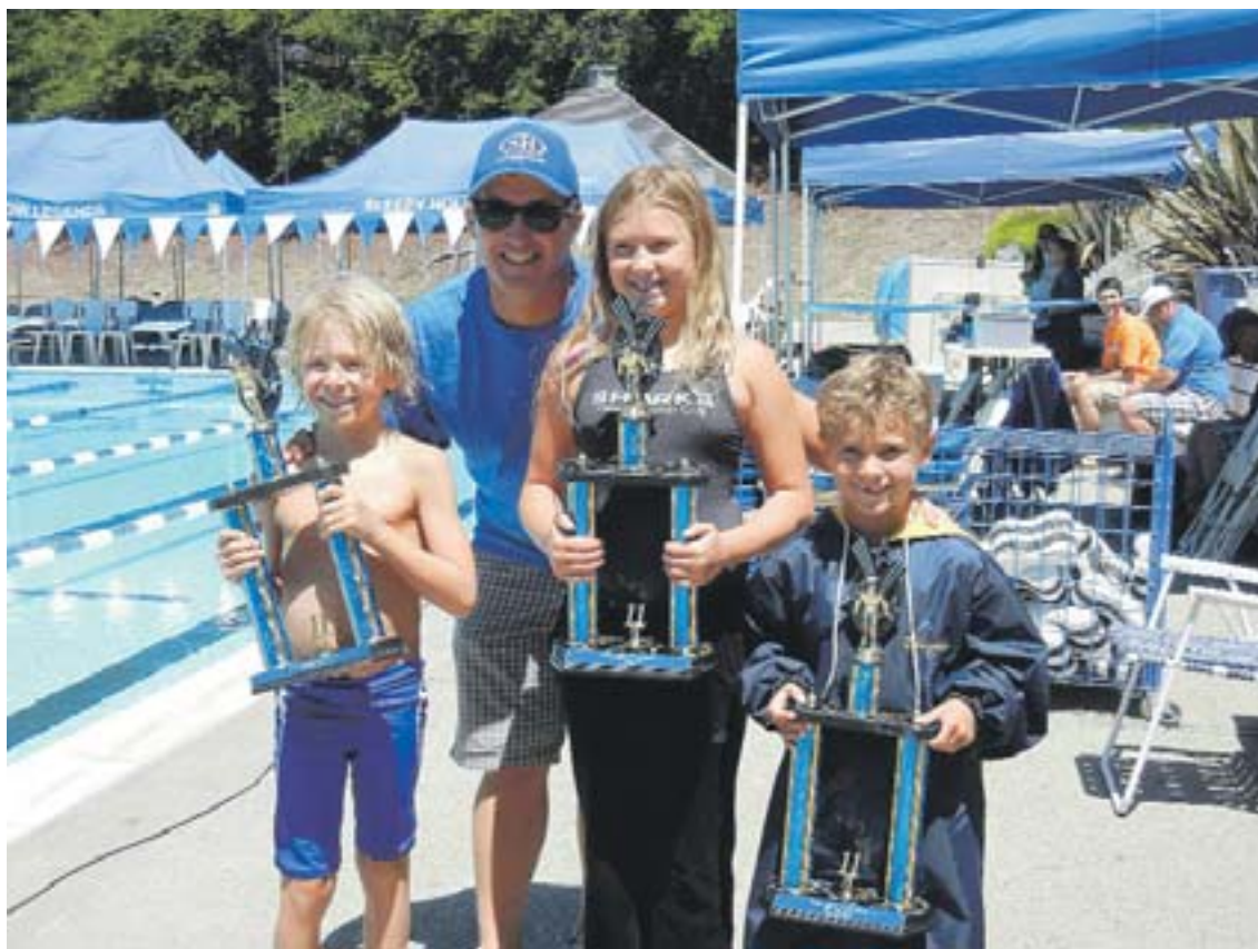
B Meet 8-and-up high point winners

On Sunday, July 24, Sleepy Hollow Swim & Tennis Club held its 25th annual 'B' Invitational Swim Meet. This meet celebrates the "B" swimmers within the Orinda-Moraga Pool Association. Some 700 swimmers participated.