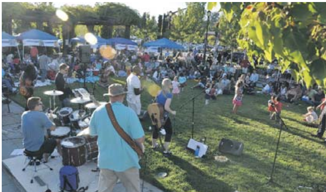
Pacific Coast Band playing at last year's Rock the Plaza