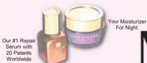
Our #1 Repair Serum with 20 Patents Worldwide