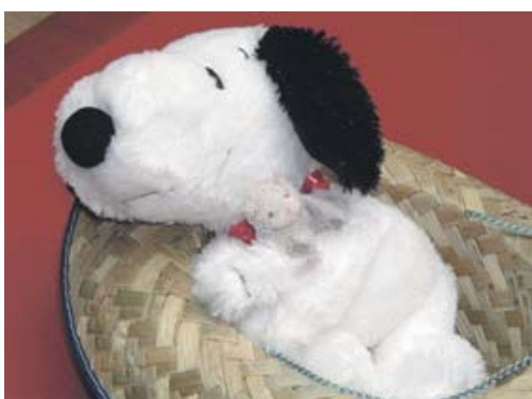
Snoopy and friend sleeping in a cowboy hat

The stuffed animal owners, pint size library patrons, were each given a photo of their critter to take home when they picked up their respective animals the following day. Skinner said it was great fun and she'll definitely host a sleepover again.