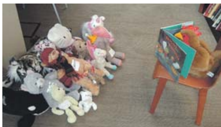
Buck Buck (the chicken reading the book) is the Librarian's assistant and side kick.

While most of the furry guests stayed up all night, Snoopy and Silvery Kitty were tucked out – so they decided to get some shut eye. A total of fifteen special stuffed animal guests, including a whale, tiger and unicorn came for the first ever Stuffed Animal Sleepover at the Lafayette Library and Learning Center.