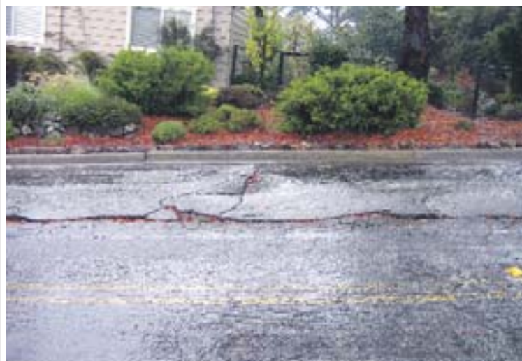
Urgent issues such as this one on Zander Drive receive priority attention from Orinda's Public Works and Engineering Department.