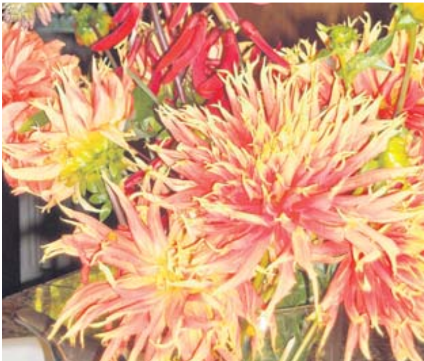
Orange and yellow spider dahlias burst with autumn hues.

Enjoy the rustling of the autumn leaves, the wine from the vine, the changing of the color guard, and the final bounty from your garden efforts. Howl at the harvest moon as Halloween is around the corner. Start gathering willow twigs for your magic wands and bewitching herbs to brew dervish drinks. The holidays will be upon us soon, but for now, we can chant merrily, "fall la la la la."