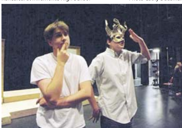
Rehearsal at Campolindo High School