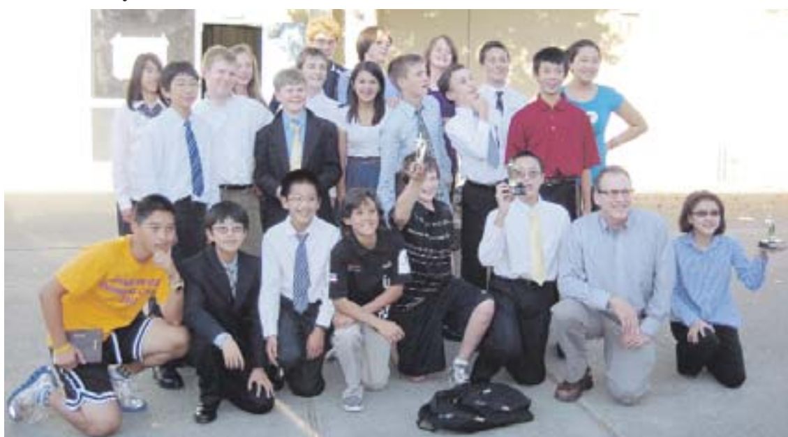
The JMIS Debate Team