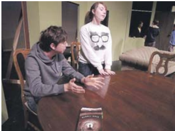
Rehearsal at Miramonte High School