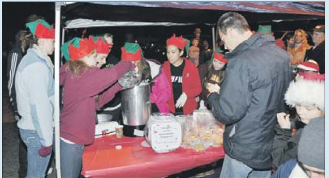
The Moraga Youth Involvement Committee serves the community at the Tree Lighting event at the Commons Park last Saturday evening.