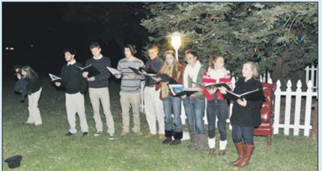
A Capella carolers entertain the crowd