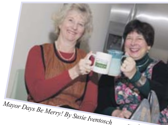
Mayor Days Be Merry! By Susie Iventosch ...read on page D4

So it's winter solstice. It's not too late to get your house ready for the cold and wet that's still ahead of us. You, of course, cleaned out your gutters weeks ago, right? If not, get that ladder up there