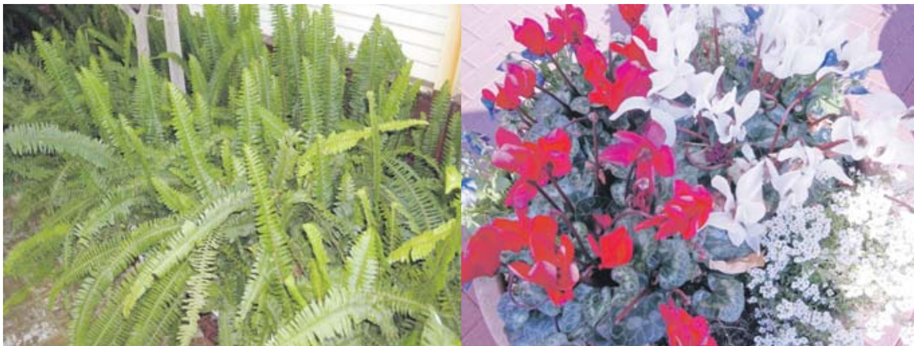
Fabulous ferns perk up a shady walkway.