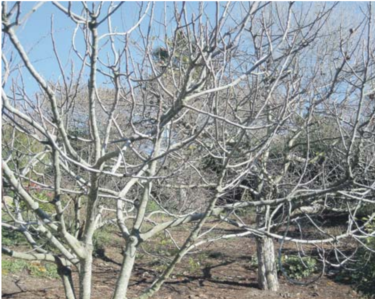
Winter waves with the beauty of barren bark on deciduous trees.