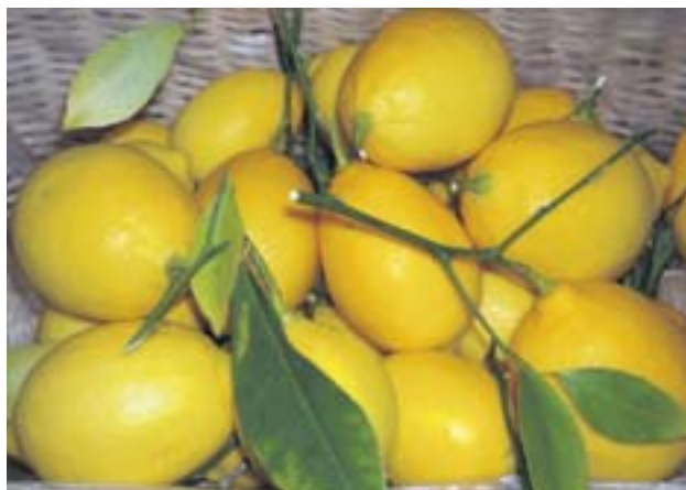
A basket of freshly picked Meyer lemons makes delicious tea rich in vitamin C to ward off colds.

This year, let's plan and plant our meals for year-round plot to plate, potager to pot, patch to platter originality. Put in peas, kale, Swiss chard, broccoli, lettuces, and Bok Choy to reap the riches of vitamins, antioxidants, and minerals, low in calories and packed with nutrients everybody craves. When we teach kids how to grow their own dinners, we introduce them to a whimsical wonderful world of wellness and wealth through the joys of garden sowing and harvesting.