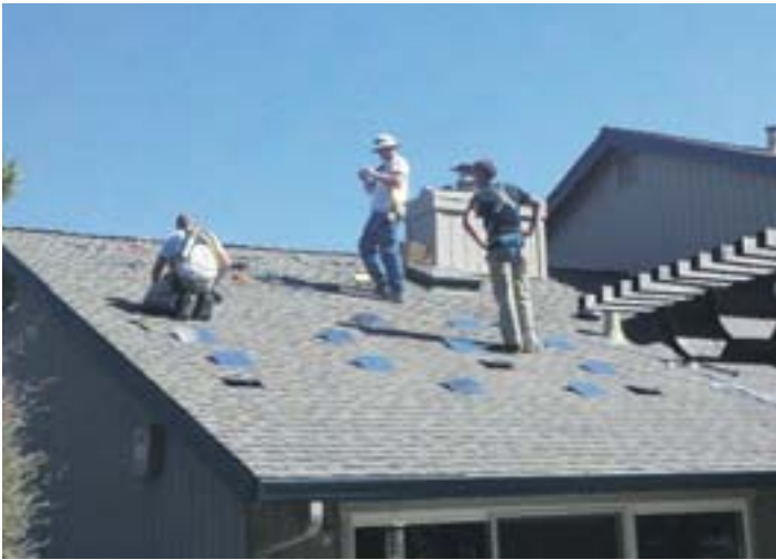
Measuring the roof