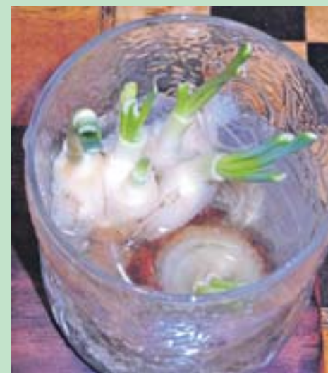
After cutting shallots or small onions, put the roots in a glass of water. Delicious, edible green sprouts thrive.

Wishing everyone a bright, cheery, healthy, wealthy 2012 as we grow into the people we are meant to be. My gratitude to you all for the role you play in the creation of my garden stories. Happy New Year!