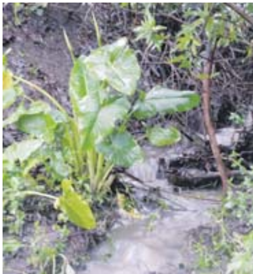
A calla lily grows by the babbling brook.

Get up, get out, and get dirty. It's Digging Deep time and we're starting fresh. Welcome to a bright new year.