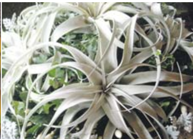
Tillandsia, a genus in the Bromeliad family, is an air plant. They are wonderful specimens for terrariums.