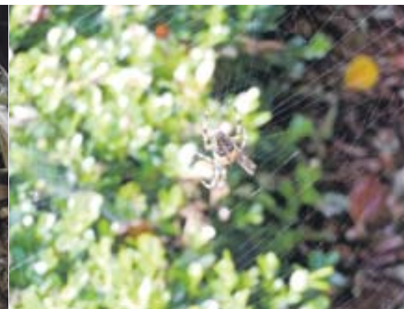
A spider weaves its magical web while protecting the garden from intruding pests.