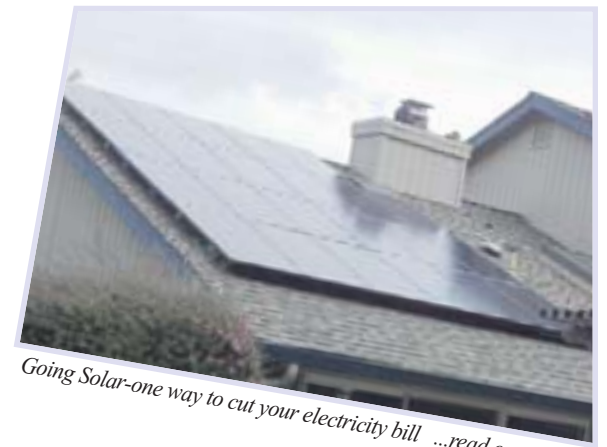
Going Solar-one way to cut your electricity bill ...read on page D7

Lamorinda Weekly Volume 05 Issue 22 Wednesday, January 4, 2012