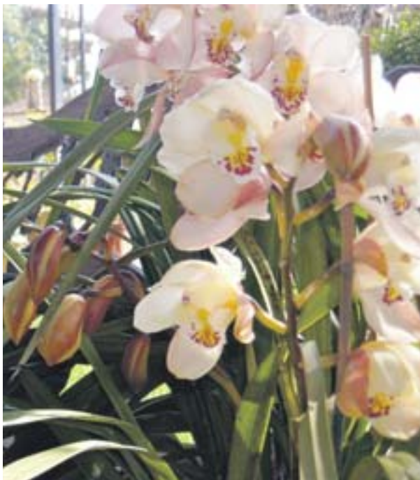
Cymbidium orchids bloom in the January outdoors.

Let 2012 be the year that you tap into the power of plants, grow your own food, and nurture your natural instinct to bond with the land. By being mindful of our fragile earth connection, we restore balance to our neighborhoods and community. It's time to get off the couch, power down the phones and computers, turn off the flat screen, and let our surround sound be that of the chirping birds, howling winds, and trickling creeks.