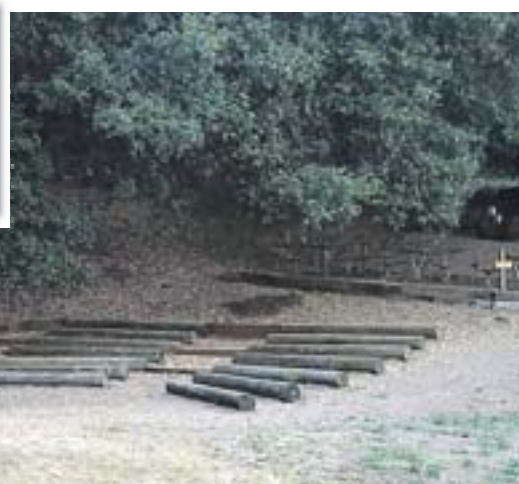
Twin Canyon Camp