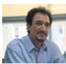
Bachir Lazhar (Fellag)

14 th Annual California Independent Film Festival, Feb 10 th - Feb 16 th , 2012