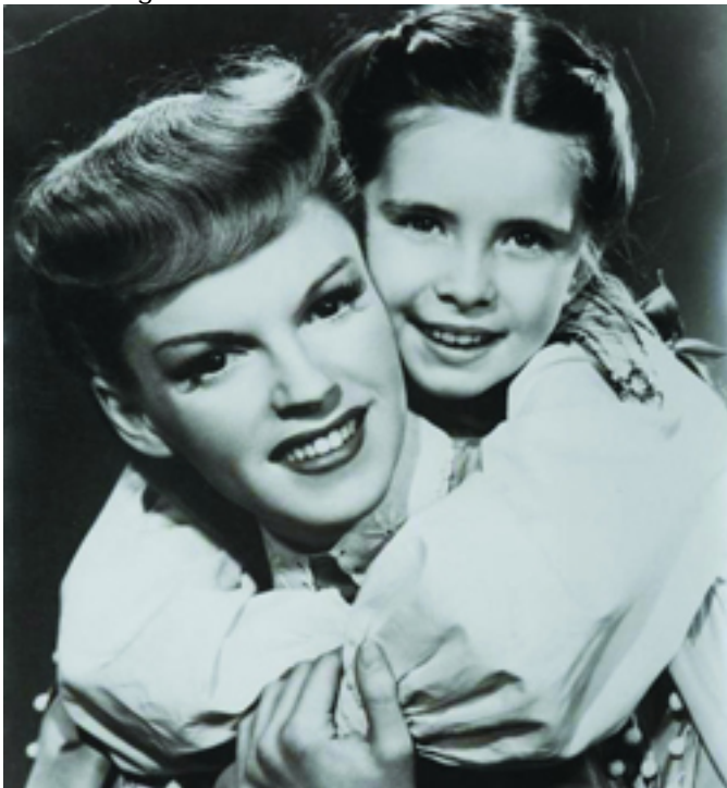
Margaret O'Brien in Meet Me in St. Louis