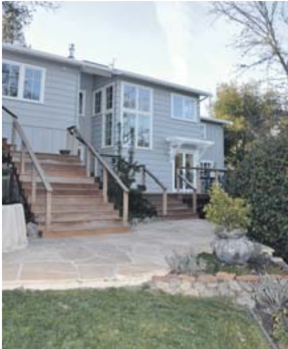
Wrap-around windows (center) provide bright natural lighting for the interior staircase off the family room.

“I really wanted this design to stand the test of time,” says Warner.