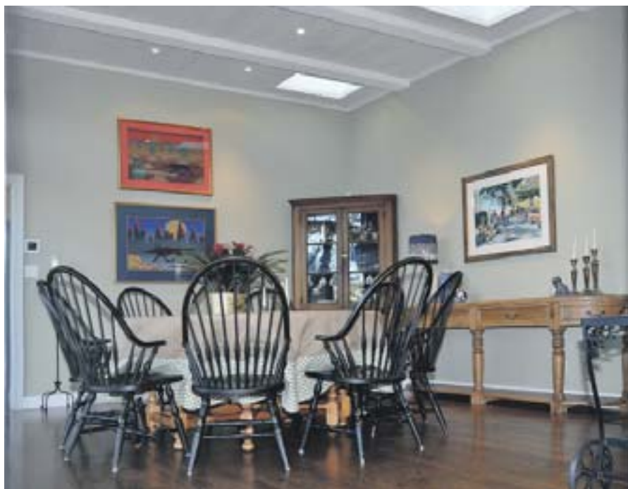
Facing toward the dining room’s glass doors, guests feel part of the greater natural world. When facing away, the dining experience is cozy.

Woven into the house’s historical tapestry are tales of fitness legend Jack LaLanne’s