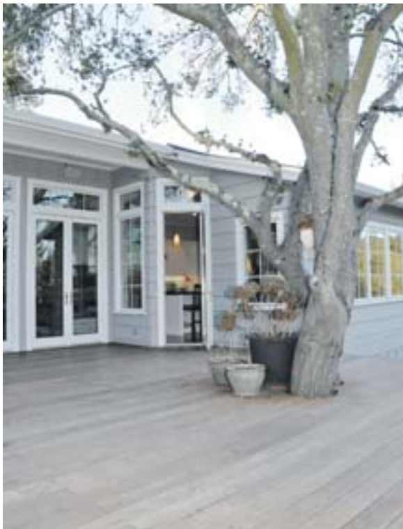
The kitchen door opens onto the expansive deck. The doors at left lead to the dining room.