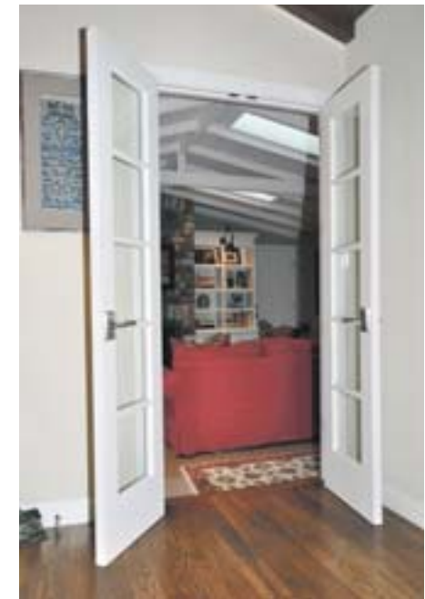
Strategically placed French doors between the family and living rooms contribute to the home’s sense of spaciousness. The hardwood floors add warmth.