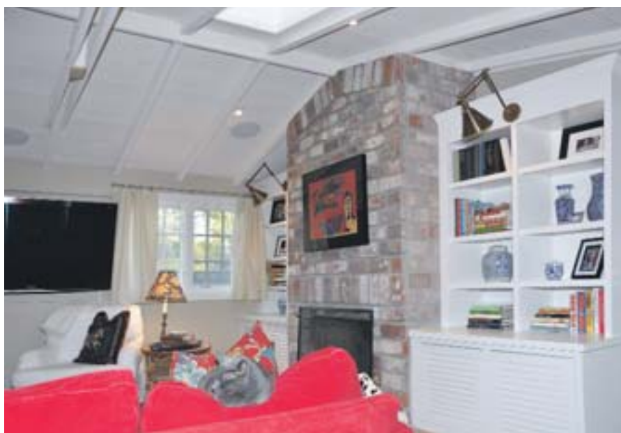
Designers maximized important historic characteristics of the home, including this original brick fireplace.

time here. The LaLanne family is credited with at least one of the residence’s numerous remodels – the enclosure of the walkway between the main house and detached garage which created a new living room area.