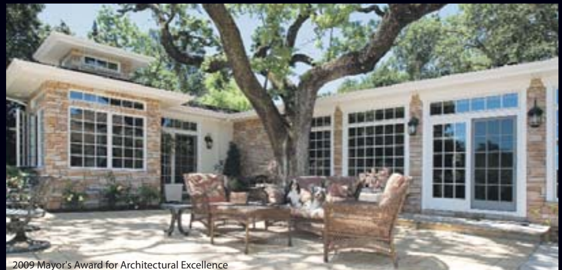
2009 Mayor’s Award for Architectural Excellence