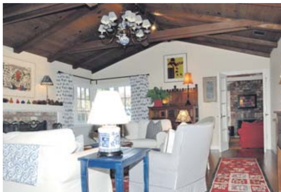
The living room’s original dark wood beamed ceilings and more subdued lighting contrast nicely with the home’s sunlit kitchen and dining room.