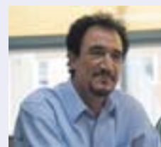
Bachir Lazhar (Fellag)