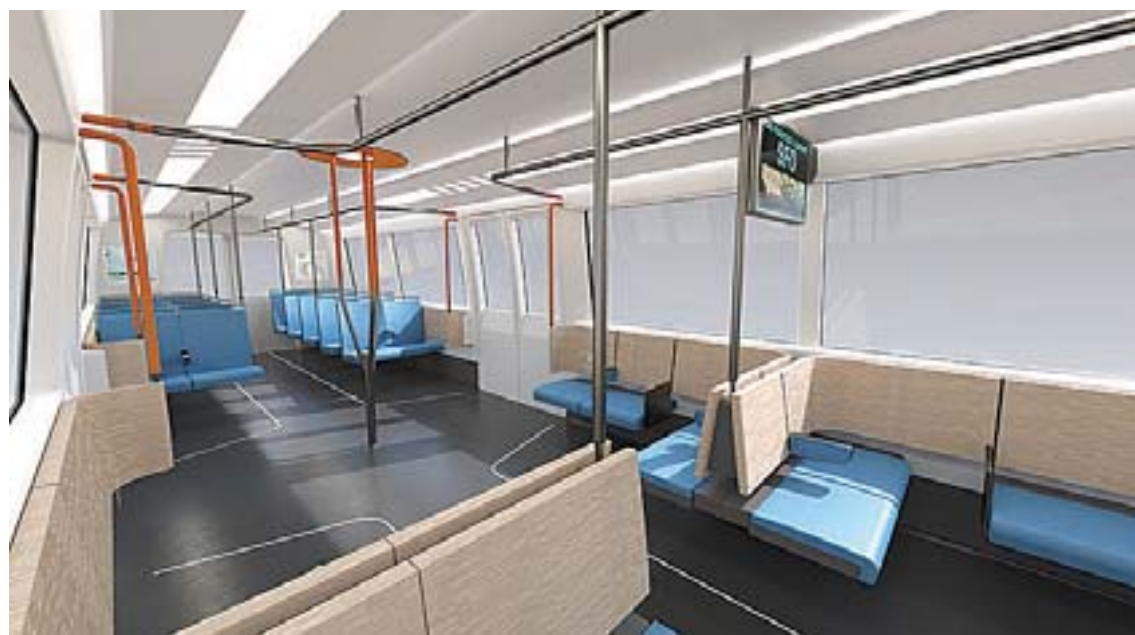
Although a final design has not been chosen, this image shows the most favored selection. Illustration provided

BMW Designworks came up with a layout that allows for more room for bikes, wheelchairs and packages made possible with input from approximately 10,000 riders and concerned residents. "The public spoke loud and clear that maximizing seating was a top priority. Designing seat configurations is a delicate balancing act of comfort and capacity," noted a report from BART on their Fleet of the Future.