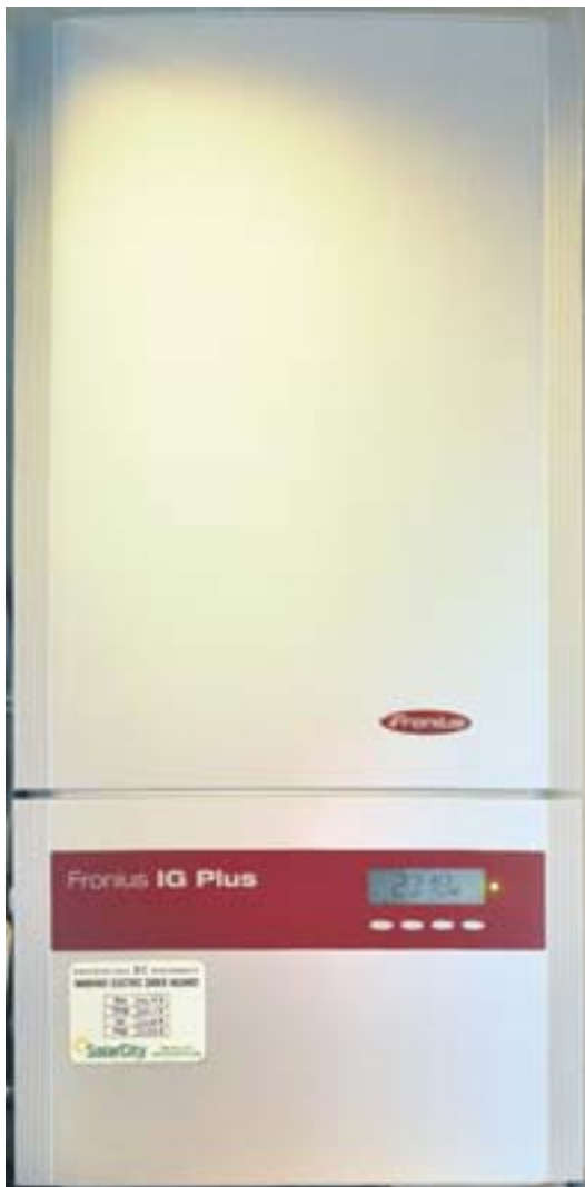
The indoor inverter is mounted on a garage wall