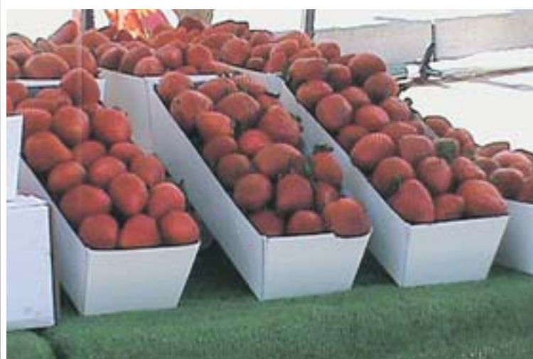
Plump strawberries were just a few of the goodies sold at the Orinda Farmer's Market, which opened March 3 - two months earlier than in previous years.

The temperature was perfect and the sky was that spectacular shade of blue that makes even long-time Bay Area natives look up and stare in wonder at the earliest season opening ever for the Orinda Farmers' Market March 3.