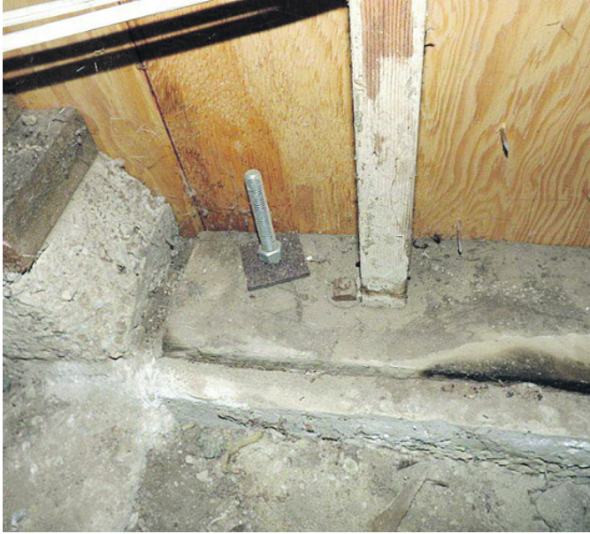
Retrofit anchor bolt with plate washer (on left) shown next to original anchor bolt and small washer.