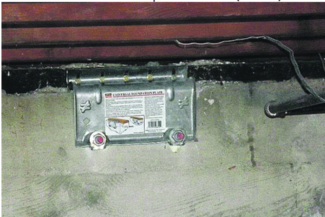
Foundation plate brace, connects concrete foundation to mud sill