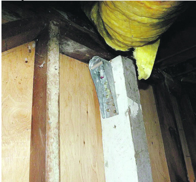
Retrofit bracing