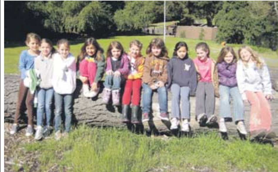
Lafayette Brownie Troop #31881 (Burton Valley, second grade) donated their troop's proceeds from this year's Girl Scout Cookie sales to the Girl Scout Twin Canyon campsite in Lafayette. The troop members also volunteered their time and energy at the Diablo Day Camp Twin Canyon clean-up day on Saturday, April 14. The girls cleared campsites and the Brownie trail to ready the camp for 10 sessions of day camp this summer. Troop members are

We are pleased to make space available whenever possible for some of Lamorinda's dedicated community service organizations to submit news and information about their activities. Submissions can be sent to storydesk@lamorindaweekly.com with the subject header In Service to the Community.