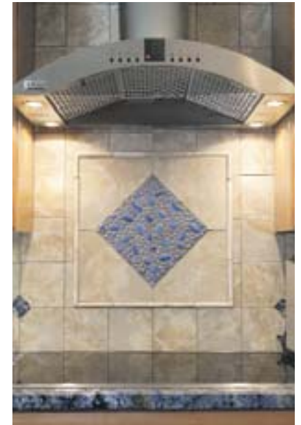
Diamond pattern backsplash inset