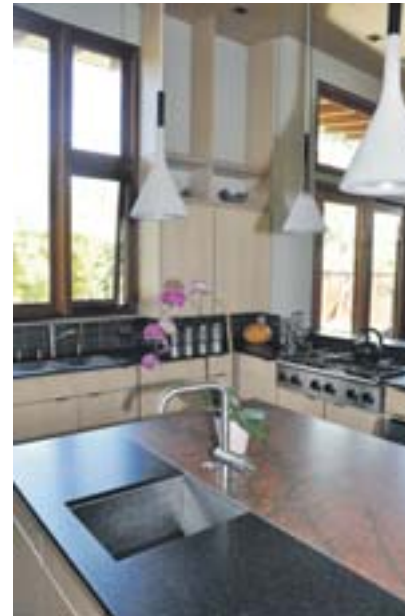
Sink in island